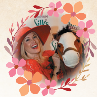
Southern Silks Stakes

Another significant accomplishment you helped us achieve during fiscal year 2023 was our ability to provide educational resources to those in our inpatient, residential, and outpatient programs. Students in our Little Rock Day Treatment program learned about science, technology, engineering and mathematics (STEM) projects through donated Rube Goldberg kits. Grant funding provided art therapy and education to several programs in our continuum. Additionally, grants allowed us to provide educational resources to the children in our care, preparing them to return to their communities and schools.