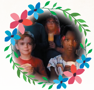
Share the Light