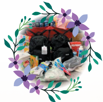
Get Up & Give