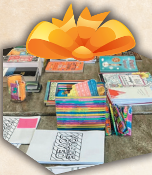
Bibles & Spiritual Guides