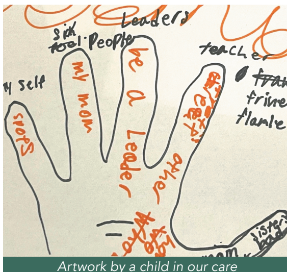
Artwork by a child in our care