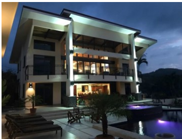
A vacation getaway to Costa Rica

Please register early! The site is open for registration right now . Also, you must register a debit or credit card to bid. Instructions on how to create an account, receive your bidding number, and start bidding are attached on a separate sheet at the end of this packet.