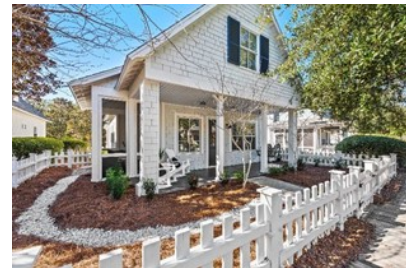
A beach house vacation poised for perfect memories