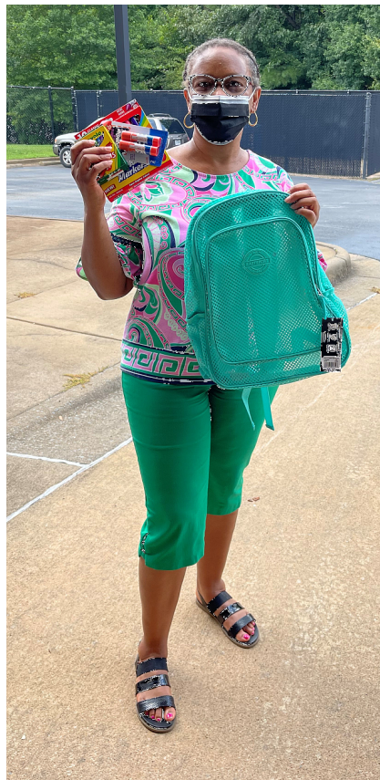
McCabe United Methodist Church School Supply Drop Off