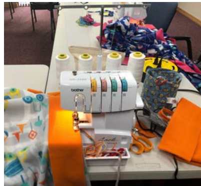
Materials used to craft items for Arkansas CARES.