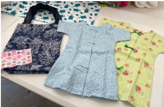
Handcrafted baby layette items from the Ruth Circle at Christ of the Hills in Hot Springs Village.