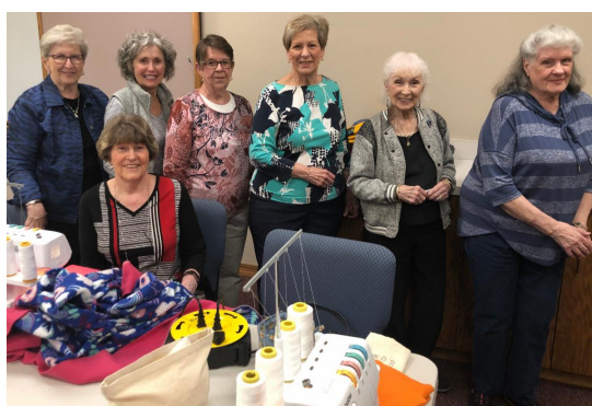
Martha's Circle from Christ of the Hills United Methodist Church in Hot Springs Village