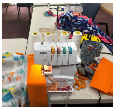
The equipment used to create donated items for children in the care of Methodist Family Health