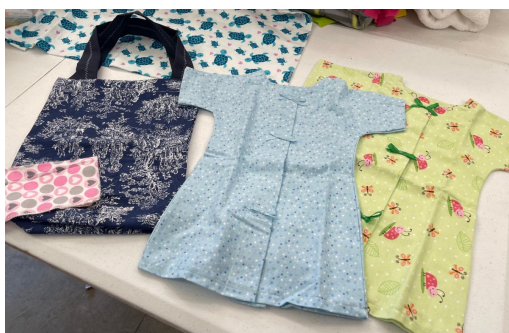
Hand sewn layettes and bags