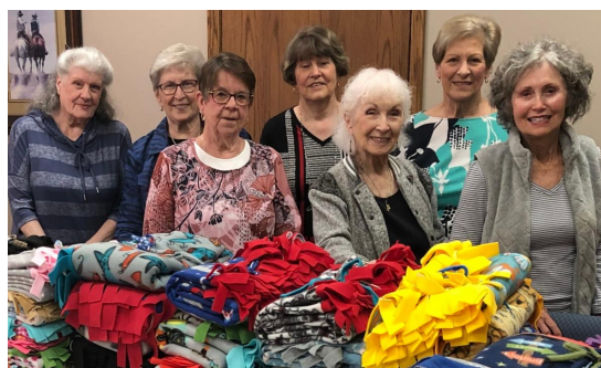
Martha's Circle displaying items donated to Arkansas children and families at Methodist Family Health.