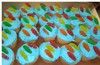
One Fish, Two Fish Cupcakes for Dr. Seuss Day