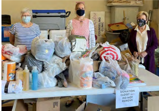
North Little Rock First United Methodist Church, North Little Rock, Arkansas