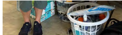
Maumelle First United Methodist Church, Maumelle, Arkansas