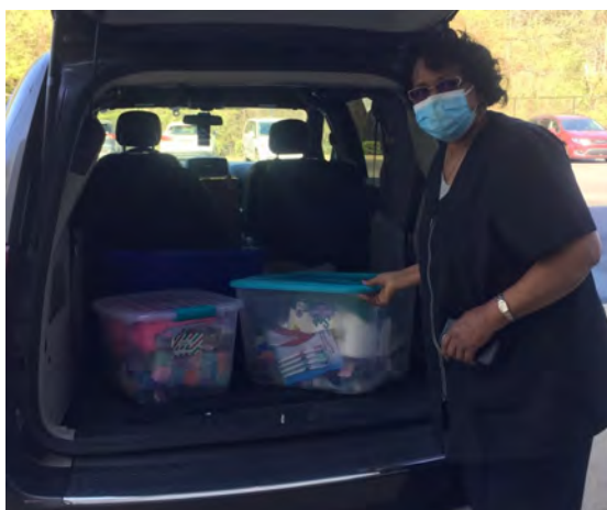
St. Luke United Methodist Church, Pine Bluff, Arkansas