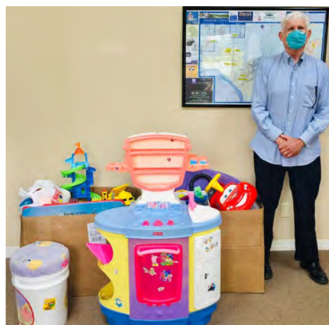
Mulberry United Methodist Church, Mulberry, Arkansas