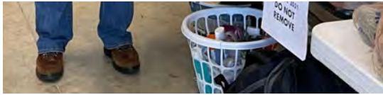
Hope First United Methodist Church, Hope, Arkansas