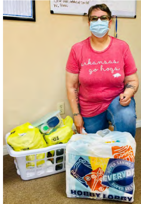
Dyer United Methodist Church, Dyer, Arkansas