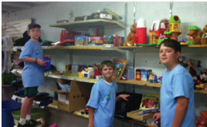
St. James volunteers tackle an organizational project at the Fillmore Campus.

St. James UMC, Little Rock, has been supporting MFH in a variety of ways. A multigenerational team of 18 "H2O" missionaries worked to organize the donation and clothes closet at the Fillmore Campus in October. The Women in Mission group tackles monthly projects for MFH and in the fall shopped for coats for the children in MFH's care. The St. James Upward Sports program selected MFH as its mission partner and presented halftime programs about MFH and took up collections. The United Methodist Women's Christmas Brunch and auction benefited MFH.