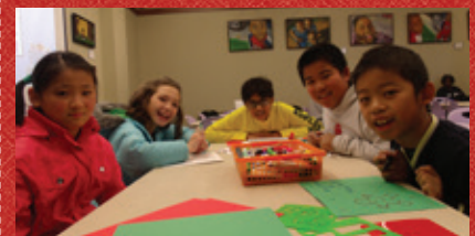
Participants in KIDS Volunteer Day at the Mosaic Templars Cultural Center in Little Rock make cards and other gifts for residents of the Methodist Children's Home.