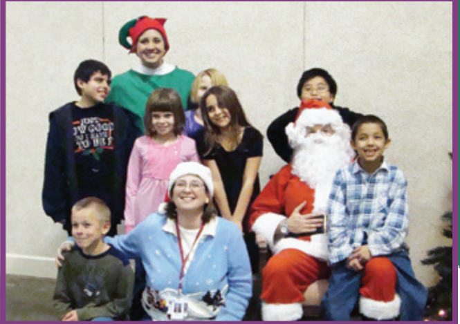
Vilonia United Methodist Church hosted a holiday party for the Vilonia school-based program.