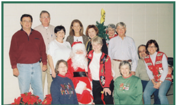
Trinity United Methodist Church in Little Rock hosted a Christmas luncheon for the women and children of Arkansas CARES. Vilonia United Methodist Church hosted a holiday party for the Vilonia school-based program.