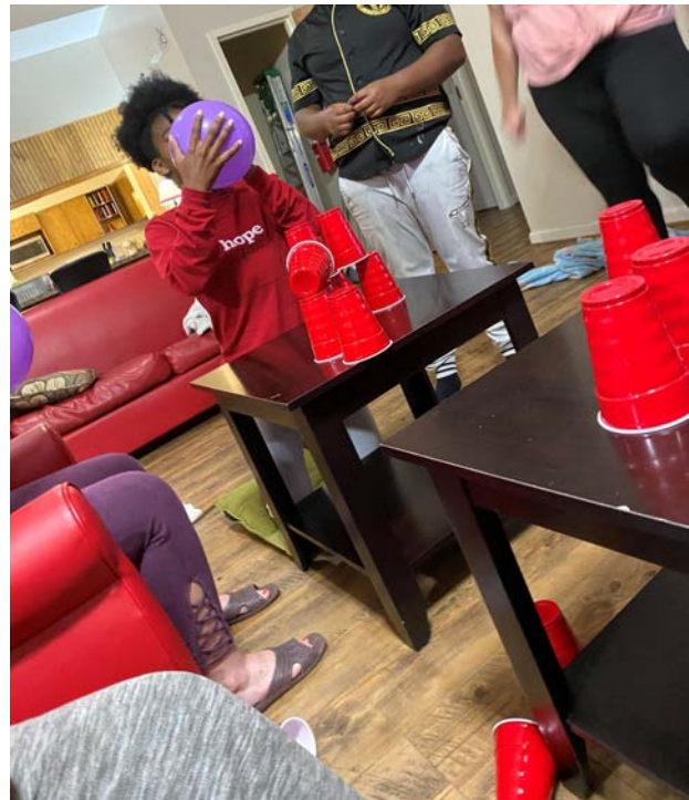
Spaghetti and marshmallows make great ad hoc erector sets while Solo cups and balloons create inventive Jenga games.